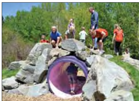
Families enjoy exploring Bozeman's new natural playground on Trails Day, June 2011.

Bozeman's first natural playground in a public park was dedicated on National Trails Day in June 2011. Located in Langohr Park along the Gallagator Trail, the playground offers an underground tunnel and landscaped rock climbing area for the young at heart. GVLT partnered with the City of Bozeman through a Parkland Improvement Grant and Greenspace Landscaping, Inc. generously donated the playground's design and installation. Other project donors included Anderson Precast & Supply, Big Sky Masonry, Montana Crane Service, Spring Hill Sod Farm, Inc., and TMC, Inc.