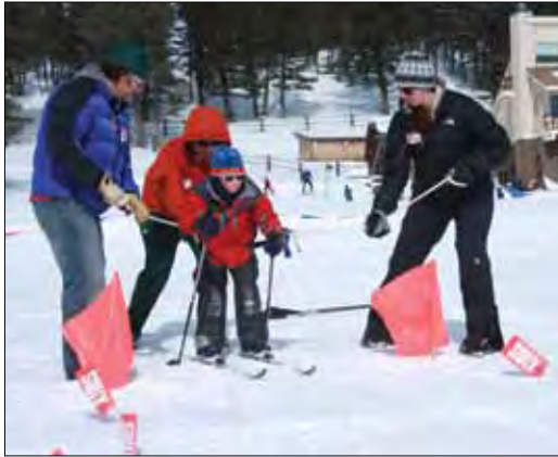
GVL volunteers assist a "Kids Fest" participant at Bohart XC Ski Ranch.