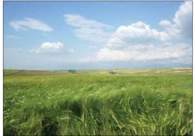
Barley fields on the Braaksma Farm.

In 2011, GVLТ was honored to partner with the Braaksma family and the Gallatin County Open Lands Program to create a conservation easement for the 210-acre Braaksma farm in central Gallatin Valley south of Churchill. The Braaksma family has been farming in the region for more than a century and acquired this land in 1938. More than 85% of their property contains agriculturally significant soils, which produce hay and grains. Yellow Dog Creek headwaters on this land; when combined with other area conservation projects, nearly four miles of this waterway are now protected. The Braaksma conservation easement combines with nine other GVLТ easements within a five-mile radius to conserve more than 5,000 acres of critical farmland in the Churchill area.