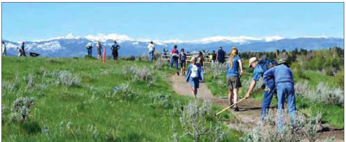
More than 100 volunteers turned out on National Trails Day to improve trails at Burke Park.

In June, GVL was honored to host National Trails Day with the greatest attendance we've ever seen. More than 100 volunteers successfully resurfaced the main trail loop at the top of Burke Park (Peets Hill). Throughout the year GVL accumulated more than 1,500 hours of volunteer trail service on projects including trail resurfacing, erosion control, and noxious weed mitigation. These volunteers hailed from as far away as Egypt, and completed projects from the East Gallatin Recreation Area to the Triple Tree Trail. The result: an improved and expanded Main Street to the Mountains trail system.