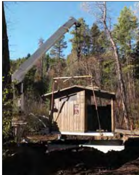
A new, permanent vault toilet was lowered into place at Sourdough Canyon Trailhead last fall.