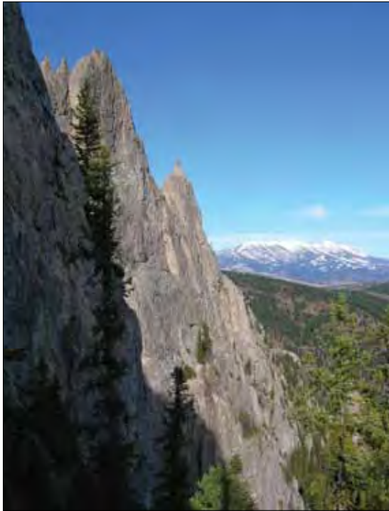
Above: The stunning view from the top of Frog Rock.